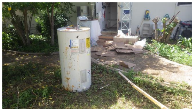
Replacing water heater, 18 October 2016

I arrived in October 2016 to cold water, bought a new water heater in town, and the photo shows everything out of the mechanical room in the process of changing out the legacy water heater. This was pretty tricky for one person working alone, but it came out OK.