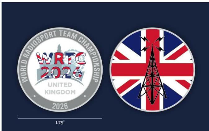
WRTC 2026 collectors' coin

I was shocked and pretty well incensed to discover on September 27 that the WRTC referee application process had come and gone between September 1 and 7. I had been stalking the WRTC website for a year