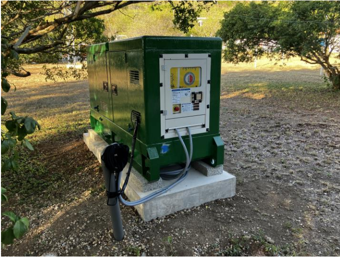
PJ2T Power and Light Company

Working from my computer in Ohio, the engine started easily after about a second of cranking, and all electrical and engine parameters came up to normal values. I ran it for 15 minutes, and was able to hear it running via the surveillance cameras. This is the capability we wanted – to be able to leave the QTH for months at a time but still keep the generator healthy through periodic remote initiated test runs.