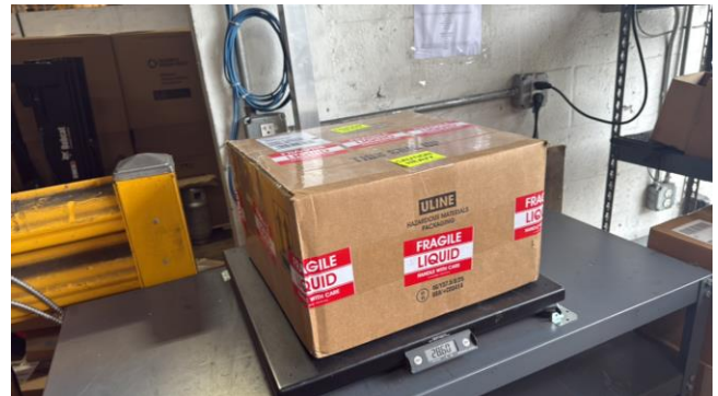
The box of varnish as received in Miami on October 9

Unfortunately, Kooyman quit importing this product from the States three years ago. I have tried several alternate varnish products and brands since then, and none of them are worth a hoot. On October 6 I searched and searched and called and called and finally found a supplier in Michigan that would retail three gallons of this Lenmar product to me. I actually got a human being on the phone who agreed to bag, then double-box and double-pad the three gallons so that they would survive the rigors of a lot of shipping and handling to get it to the island. So it left Detroit October 6 and was delivered October 9 via UPS Ground to the freight forwarder in Miami, then on to the island. I've coordinated with my contact gal at the ocean freight handler and sent her all the needed paperwork.