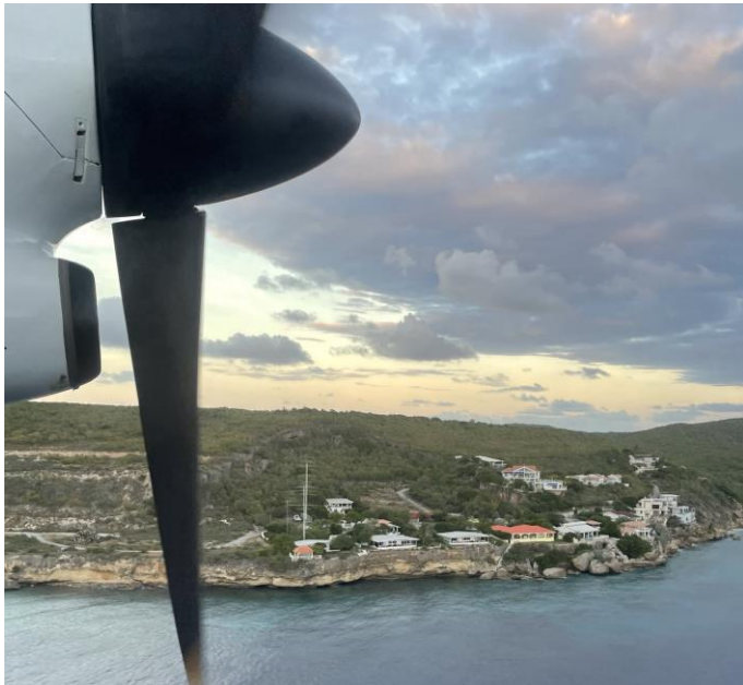
Signal Point from the Coast Guard plane, December, 2024

We have all seen these flights zooming by at low altitude and high speed as part of their drug interdiction and perimeter security mission around the island.