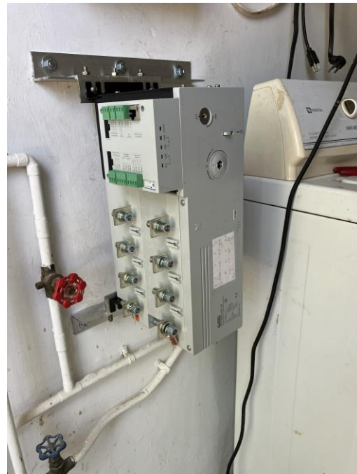
Our Three Phase 50 Hz Transfer Switch

You may recall that the Slovenian transfer switch we bought for the diesel generator was "open frame" so that it could be installed within a pre-existing metal electrical box.