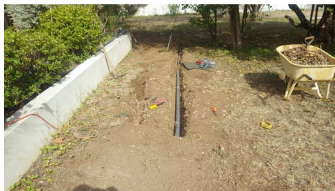
Progressively repairing broken radials and covering the 50 mm fiber conduit as it approaches the house, March 16.