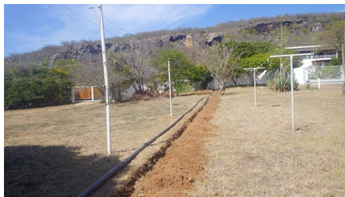
Part of the 75 mm PVC fiber conduit prior to installing it in the ditch March 12, 2022.