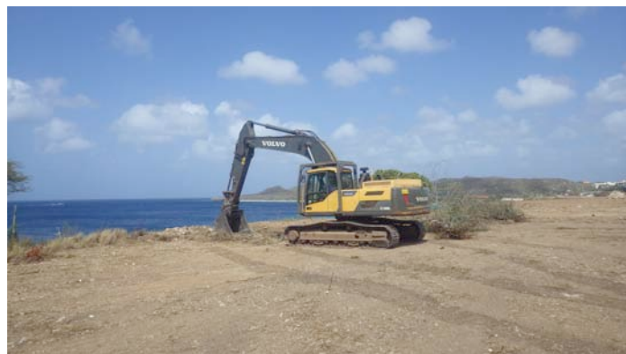
My friend Rick on the backhoe very kindly stopped at this point about 200 feet short of Signal Point at my request, retaining the brush and side yard that help Signal Point feel a bit more private.