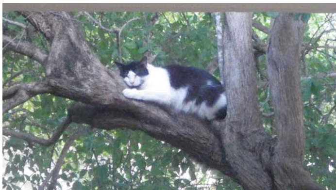
Crawford sleeping soundly in a Signal Point tree, dreaming of sardines and milk, January 31, 2022.