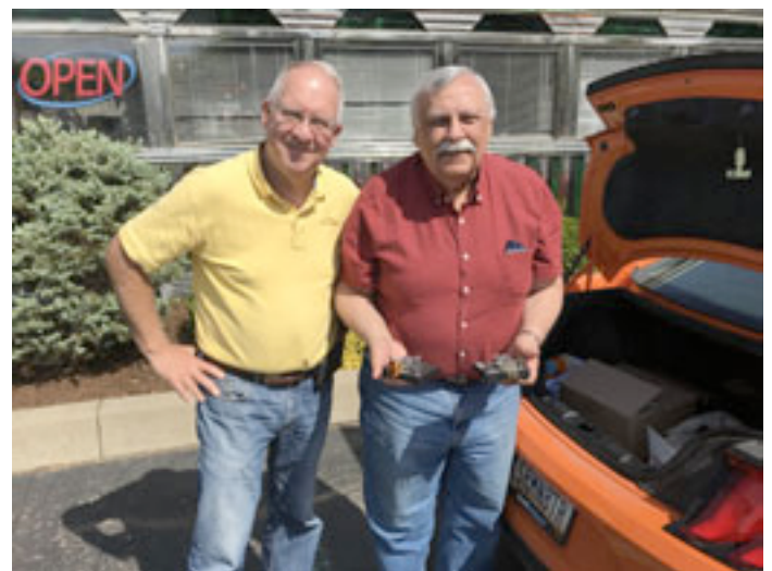
W8PT donating two Bencher paddles, May 15, 2021.